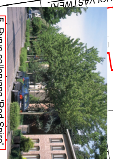
5. Pyrus calleryana Red Spire