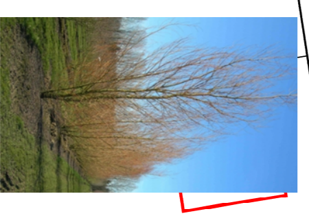
3. Salix alba Chermesina