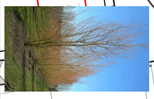
3. Salix alba Chermesina