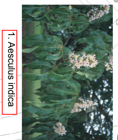
1. Aesculus indica