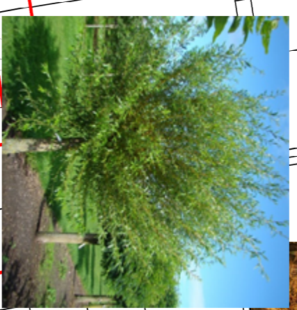
Salix alba Chermesina (knowing)