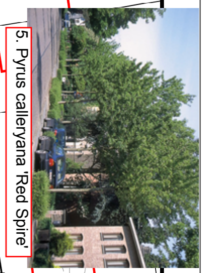
5. Pyrus calleryana Red Spire