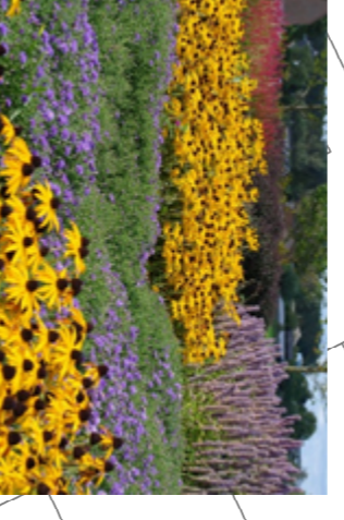
D. vastie planten