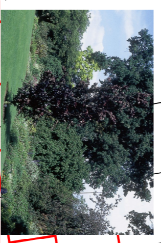
6. Fagus sylvatica Darwyck Purple