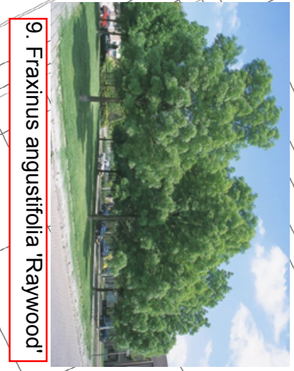
9. Fraxinus angustifolia Raywood