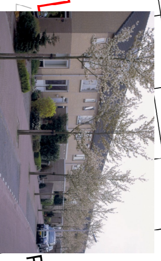
8. Amelanchier alba Robin Hill