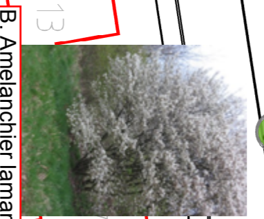
B. Amelanchier lamarkii