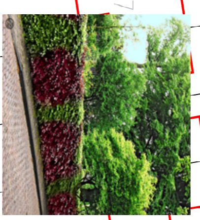
C. Beukenhaag gemengd