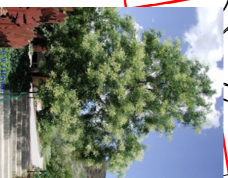
4. Sophora japonica Regent