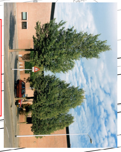
2. Tilia cordata Böhles