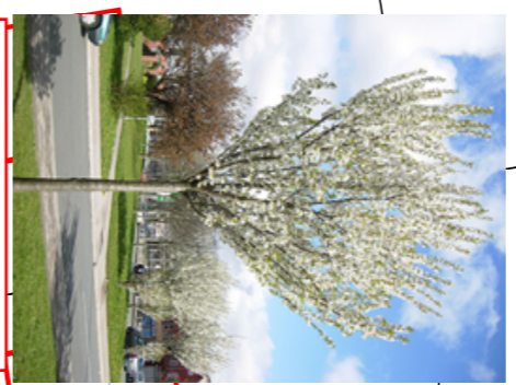
7. Prunus Urmelkei